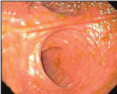
Figure 56-1. Ileal pouch in UC patient 6 months after IPAA.